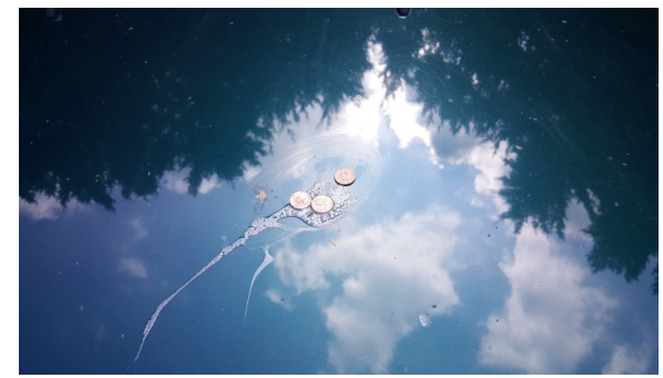
Sept. 17, 2017 - Three Pennies

Eagles soaring on winds swept up treeless hills Of brown summer grass or, climbing in thermal drafts Over broiling prairies -- To be one with the wind, Freed from tugs of earth to wheel and swing In wild abandon with exuberant spontaneity Through mansions of air -- Eyes of a 10-year-old Childhood dreams of eagles' views of earth. Chuck Overby, 6/25/78